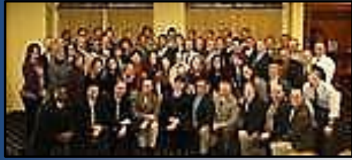
2012 Boot Camp Participants

To see the world impacted for Jesus Christ through the influence of athletes and coaches.