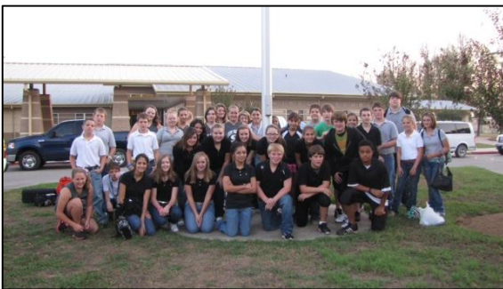
Liberty Middle School See You at the Pole

JOIN THE TEAM...To find out more about FCA or to donate to FCA - visit fca.org or houstonfca.org