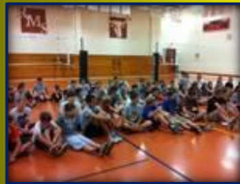
Riverwood M.S. "Longhorns"