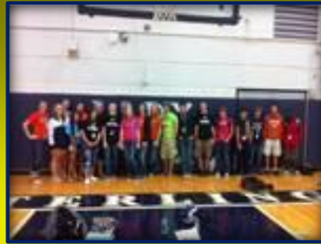
Baytown Sterling H.S. "Rangers"