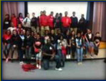
North Shore M.S. "Mustangs"