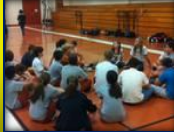
Riverwood M.S. "Longhorns"