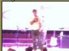
High School Student