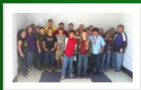
Big Sandy Middle School