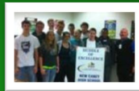
New Caney High School