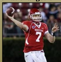
College Student Athletes